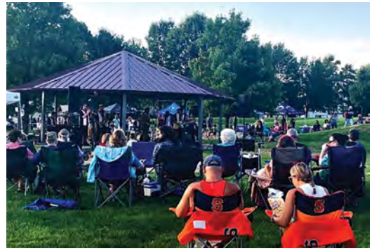
Concertgoers enjoy a beautiful evening at the park.

The gazebo structure is located close to the playground, so when it's not being used as a bandstand, parents can sit in the shade at the picnic tables while watching their children play. People can also use it for visiting with family or friends, playing cards together, or just sitting and enjoying a day at the park.